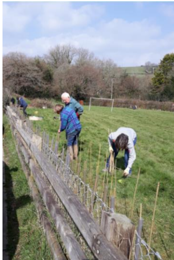
Hedge planting to enhance our local playground

We also promote healthier areas for nature, especially via linked-up 'wildlife corridors' in our Parish, along hedges, meadows and around the Bidwell Brook.