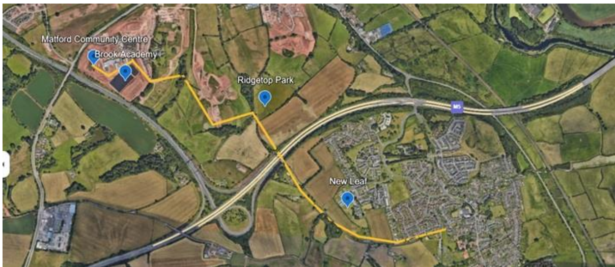
Matford- Ridgetop – Deepway – Exminster Green corridor

Beyond the core village further discussions have developed on the enhancement of a 'Green Wildlife Corridor' between the Matford Development, through the Ridgetop Country Park and down to Exminster – working with Matford Brook Academy, the developers of the Matford Community Centre – ISG Ltd, the Greenspaces team of Teignbridge District Council and NHS New Leaf. Following an initial 'walk the route' session, we could see a number of areas where the habitat connections might be strengthened over time – possibly enabling an expansion of dormouse ranges From known habitats in the Ridgetop park) and improved connectivity for bats and other species.